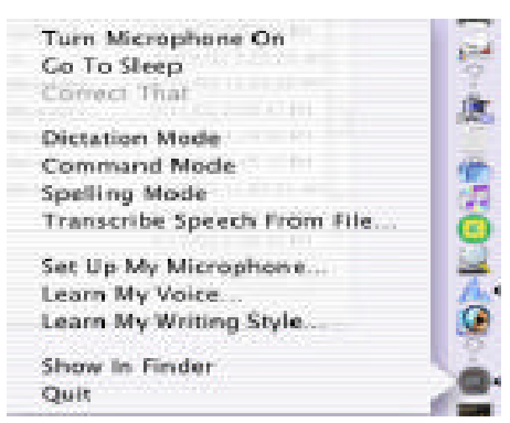
iListen's options pop-up from the dock

If you already have a microphone that isn't on the list, don't worry; chances are it will work. iListen's Set Up My Microphone assistant should adjust the levels of most